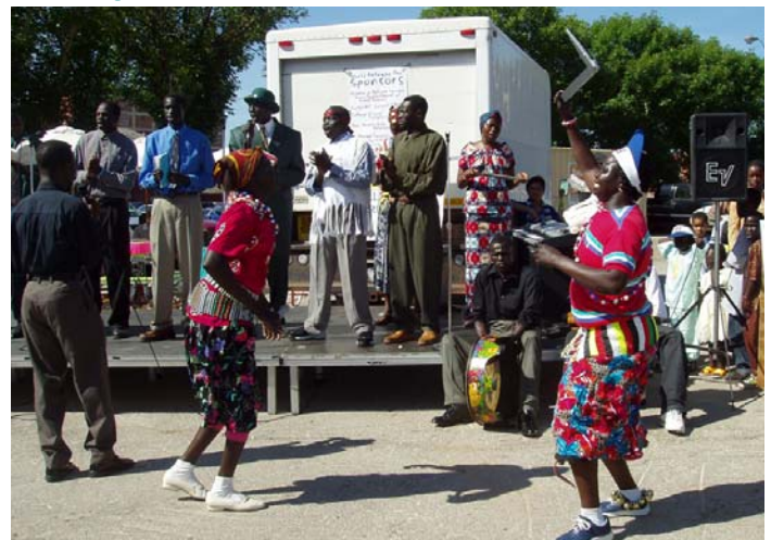
Pictured are the Mabaan Dancers and Choir from Cottage Grove Presbyterian Church in Des Moines performing at the 2005 World Refugee Day.