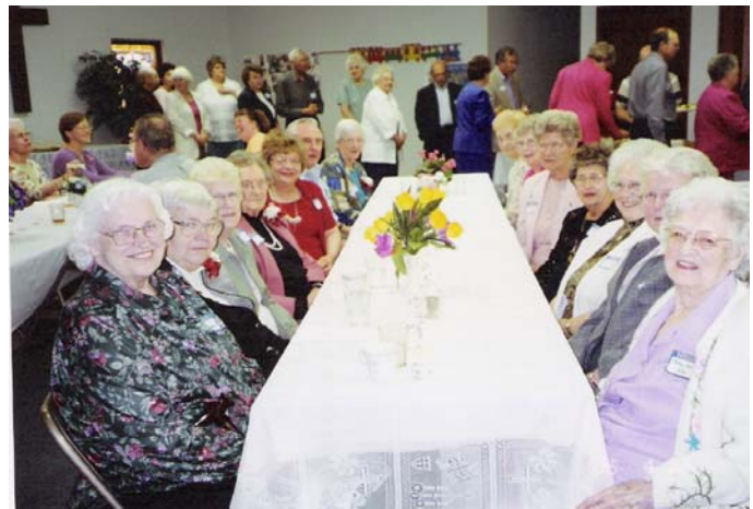
Attendees celebrate ordained women's anniversaries at Humeston Christian-United Methodist Church.

Observed were the 100 th anniversary of the ordination of women as deacons (1906-2006), the 50 th anniversary of the ordination of women to the Office of Word and Sacrament (1956-2006), and the 75 th anniversary of the ordination of women as elders (1930-2005).