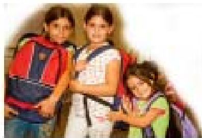
2008 CROSS Back-to-School Giveaway